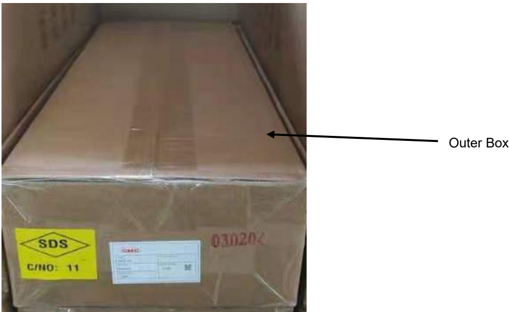
Table 1. Packing information